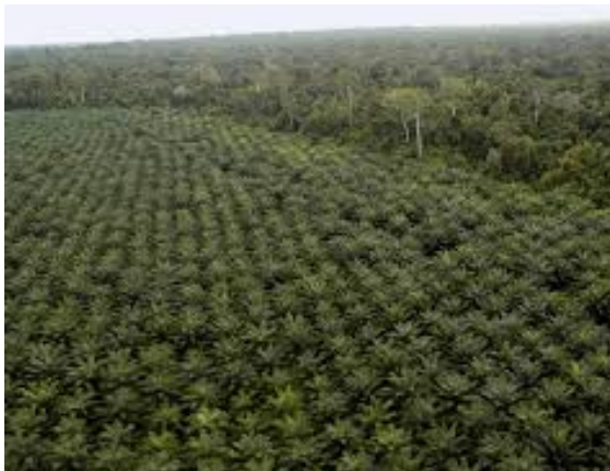
The degradation of the orangutans' rainforest home after it is scheduled for destruction.